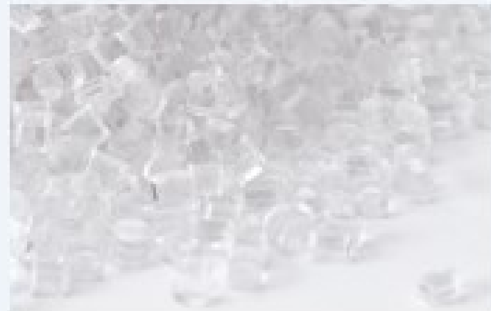
Plastics & Chemicals