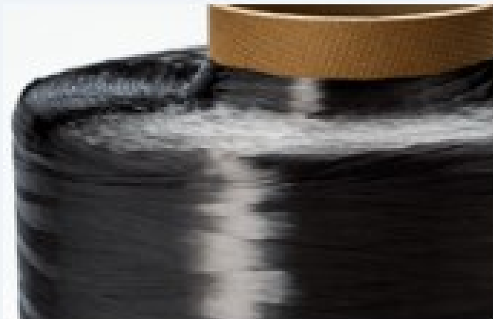
Carbon Fiber Composite Materials